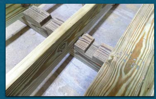
2x6 Pressure Treated Joists 2x4 are Standard