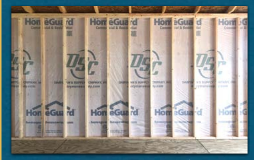
House Wrap Vapor Barrier Recommended if you plan to insulate