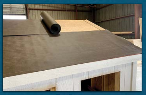
Tar Paper Under Roofing Only. Recommended for Shingle Roofs