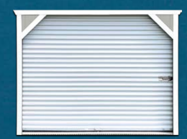
9' x 7' GARAGE

Door trim will either be painted for LP Smart Panel Siding or Water Sealed for T1-11 Pressure Treated Siding.