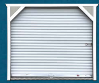
8' x 7' GARAGE